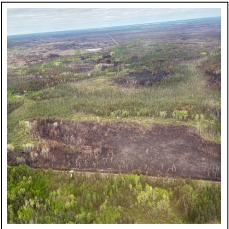
Where the fire started along the railway

The RM has not lifted the State of Local Emergency.