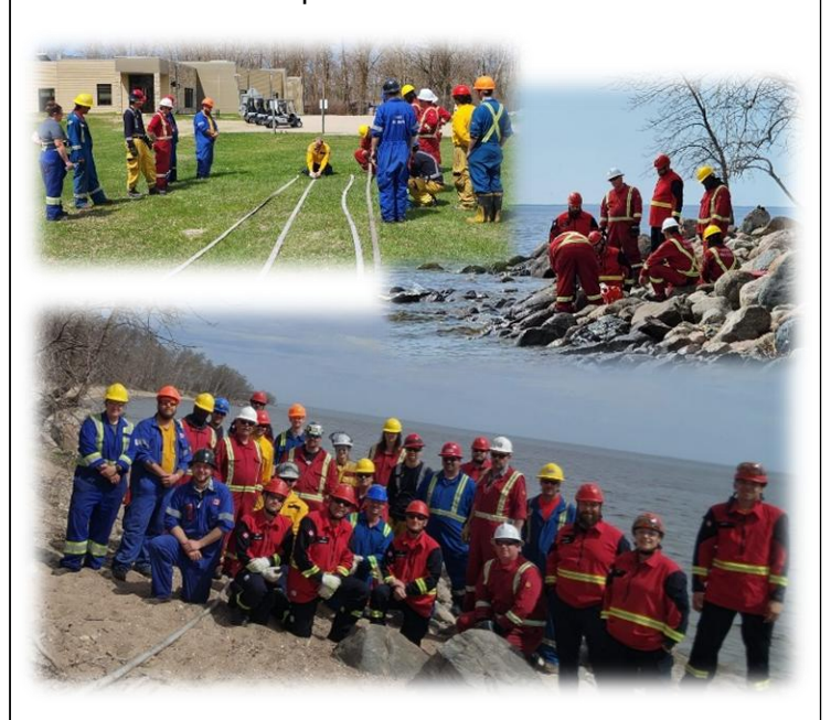
Session 2 – Coming in 2026!

Session 1 – Type 3 Wildland Fire Fighter Training provided by the Manitoba Wildfire Service took place May 9<sup>th</sup> – 11<sup>th</sup>, 2025 at the Buffalo Point Resort Centre with a total of 24 fire fighters from the RM of Piney and Buffalo Point fire departments.