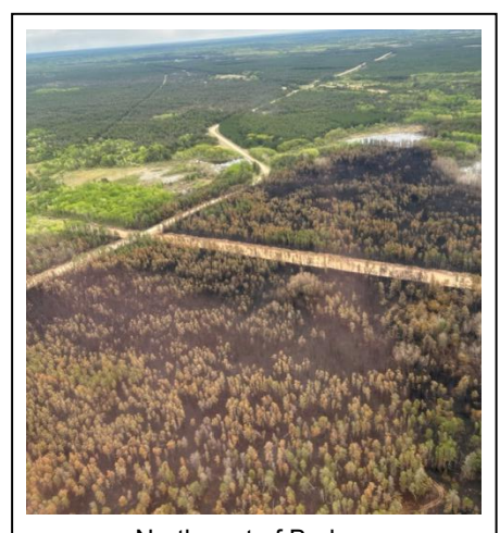
Northwest of Badger