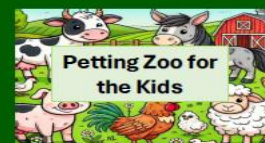
Petting Zoo for the Kids

Registration 11:00 am – 2:00 pm Drew Gushulak (204) 380-2544