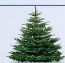
Christmas trees (real)