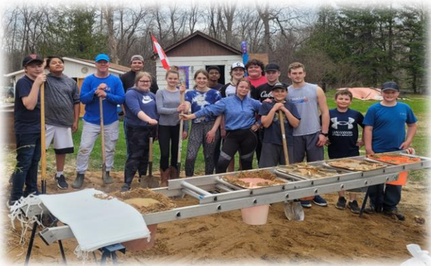
Volunteers from Ross L Gray School sandbagging for one of our residents near Sprague.

MUNICIPAL ROAD WEIGHT RESTRICTIONS LIFTED!