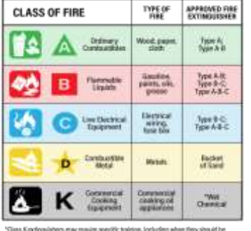
Class A contriguishon may raquira specific treating, including when they should be used or not used. For example, the entinguishing agents in many-Class K entinguishors are electrically sandscribe and should only be used efter electrical power to the Klocker appliance has been shut of

Your most common "go-to" fire extinguisher for household and basic needs is the combination ABC fire extinguisher that is capable of fighting those classes of fires. Using water to extinguish is an option but not recommended for use on flammable liquids such as stove top cooking fires. Take the time to read the instructions on your extinguisher now and