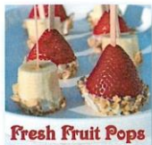
Fresh Fruit Pops

Berries have antioxidants & potassium. White chocolate chips are brighter, but dark chocolate will have more antioxidant benefits.