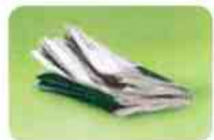
Newspapers and flyers

These are types of recyclable materials accepted in your recycling program: