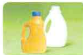
HDPE #2 plastic containers