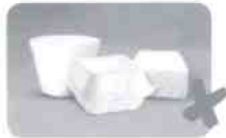
Foam packaging of any kind