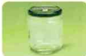
Glass food and beverage containers