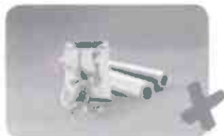
Wax or foil coated paper