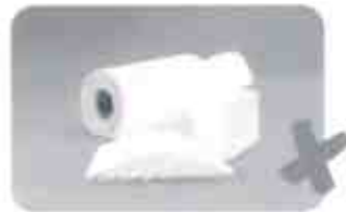
Paper towels, tissues or napkins