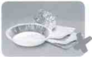
Aluminum foil, foil pie plates or foil food containers

Please do not place any of these items in your blue bins.