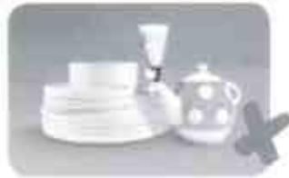
Dishes, ceramics or crystal