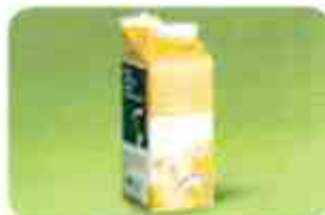
Gable top containers