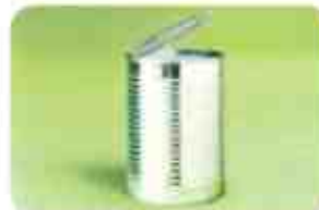
Steel food and beverage containers