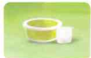
#4, #5 and #7 plastic containers