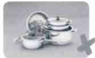
Steel pots and pans or scrap materials