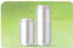
Aluminum food and beverage containers