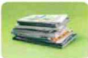
Magazines and catalogues