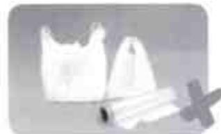
Plastic bags or cellophane