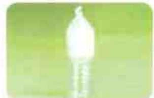
PET #1 plastic food and beverage containers