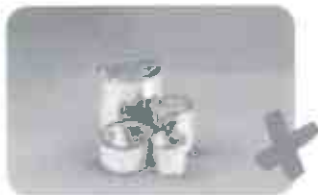
Paint cans or oil cans