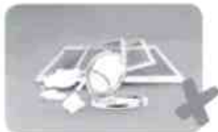
Window glass, mirrors or broken glass