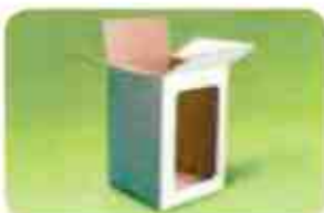
Residential corrugated cardboard