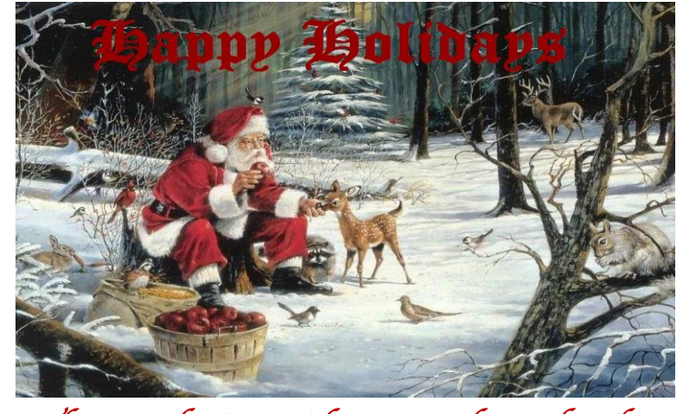
The RM of Piney wishes you and your family a very Merry Christmas and a wonderful new year!

The RM of Piney office will be closed to the public for the Holiday Season from Monday, December 25<sup>th</sup>, 2017 to Monday, January 1<sup>st</sup>, 2018. The office will <u>re-open to the public on Tuesday, January 2<sup>nd</sup>, 2018.</u>